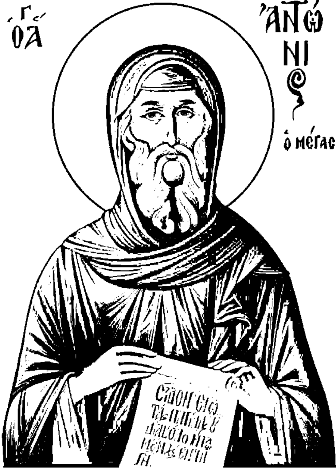
ST. ANTHONY THE GREAT ΑΓΙΟΣ ΑΝΤΩΝΙΟΣ Ο ΜΕΓΑΣ