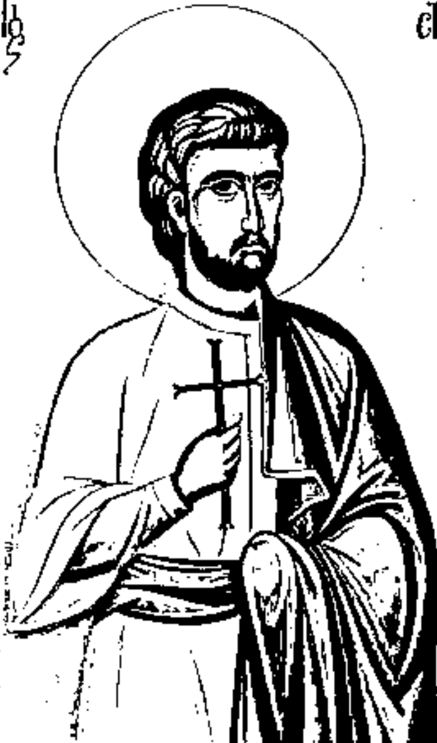
ST. STAMATIOS OF VOLOS ΑΓΙΟΣ ΣΤΑΜΑΤΙΟΣ ΑΠΟ ΤΟΝ ΒΟΛΟ