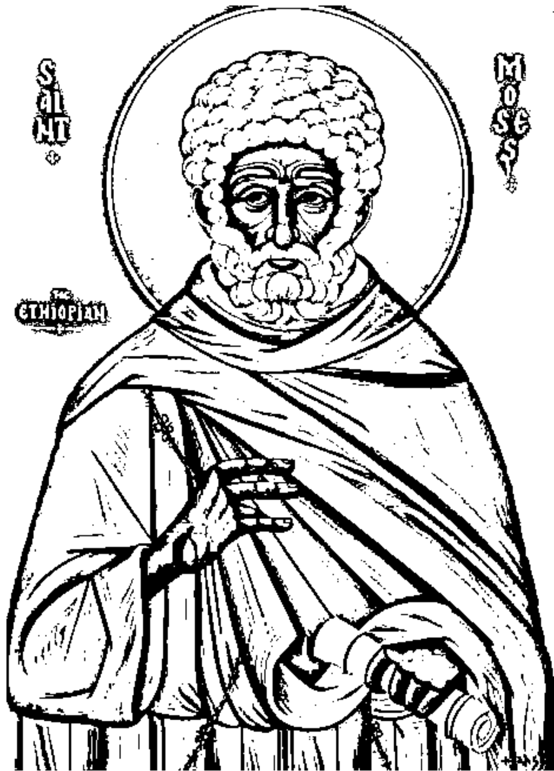
ST. MOSES THE BLACK ΑΓΙΟΣ ΜΩΥΣΗΣ Ο ΑΙΘΙΟΠΑΣ